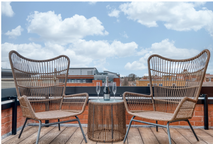
Foregate Street Apartment 9, 10 and 11